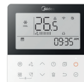
Wired Controller KJR-120M1 (included)